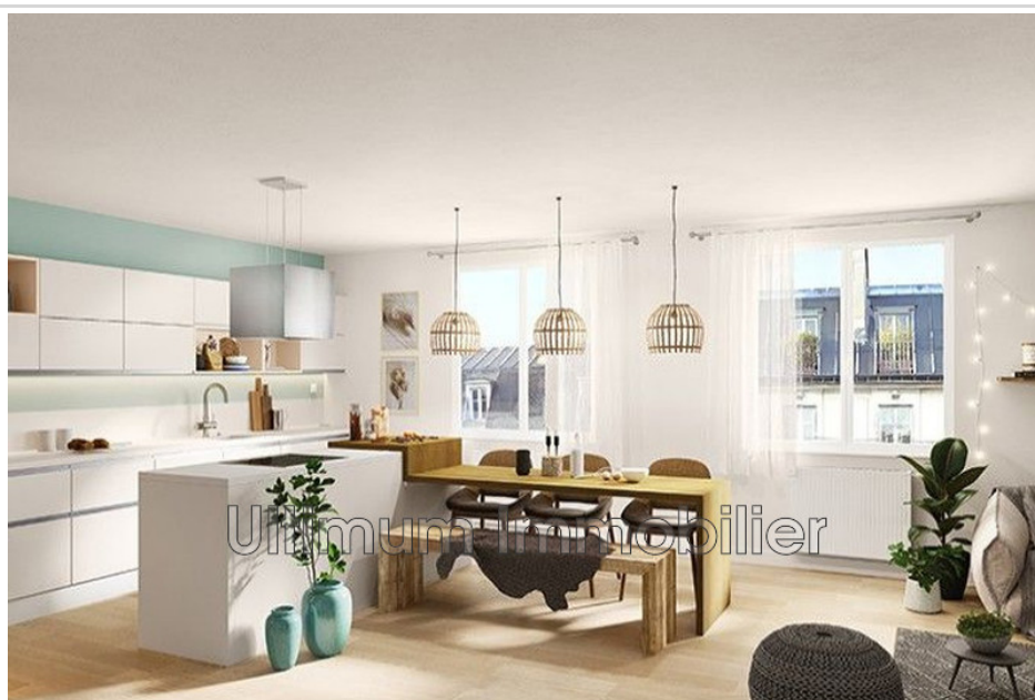
Apartment 2025017CV Nice